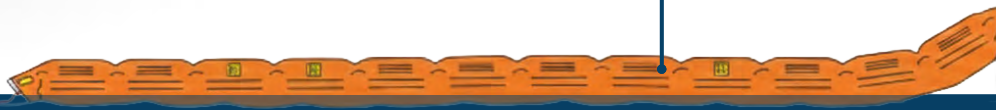
HARBO T6 UHD BOOM